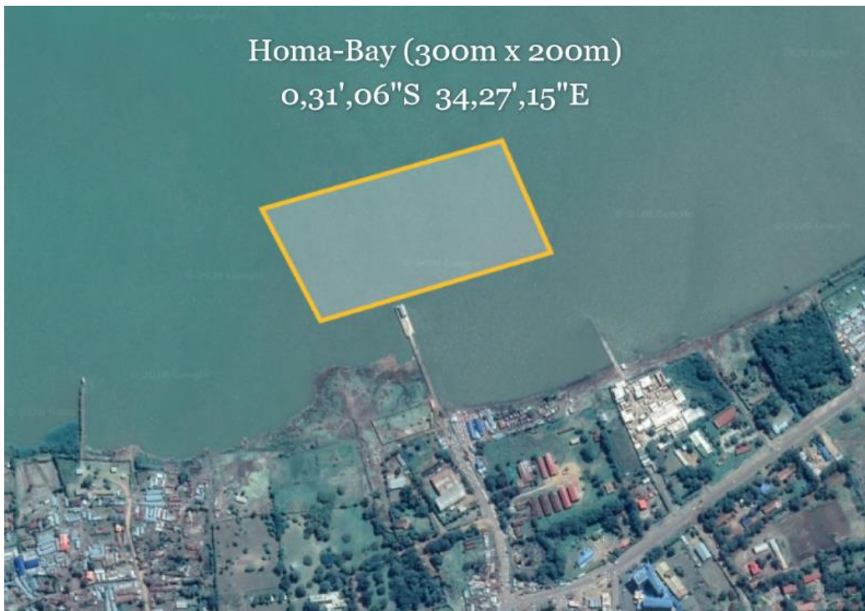
Figure 7: HomaBay Feeder Port