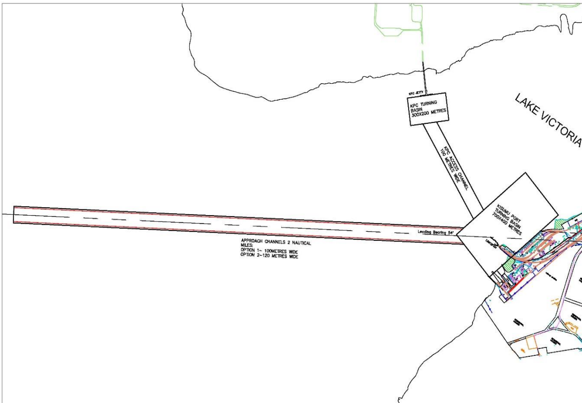
Figure 1: Overview of Kisumu Port Dredging Works