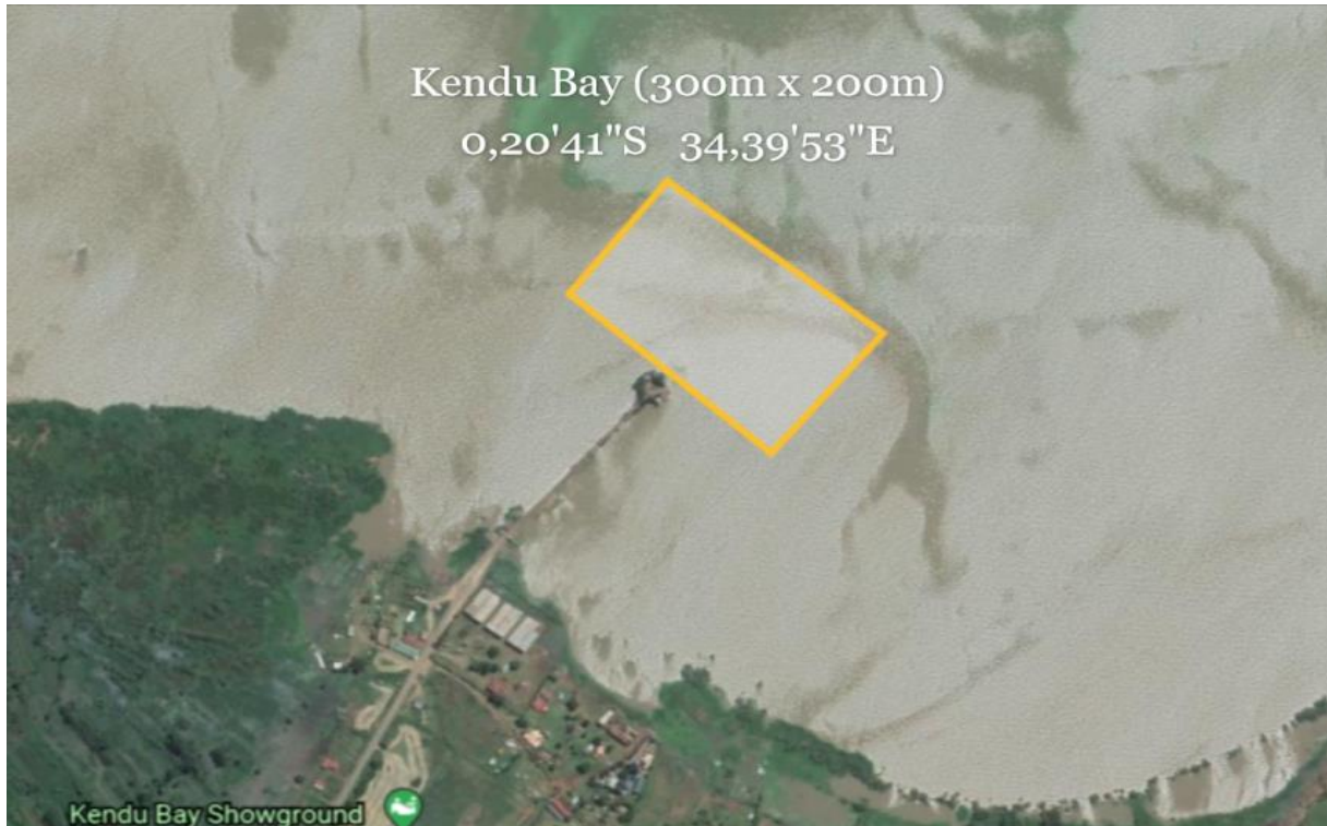
Figure 6: Kendu Bay Feeder Port