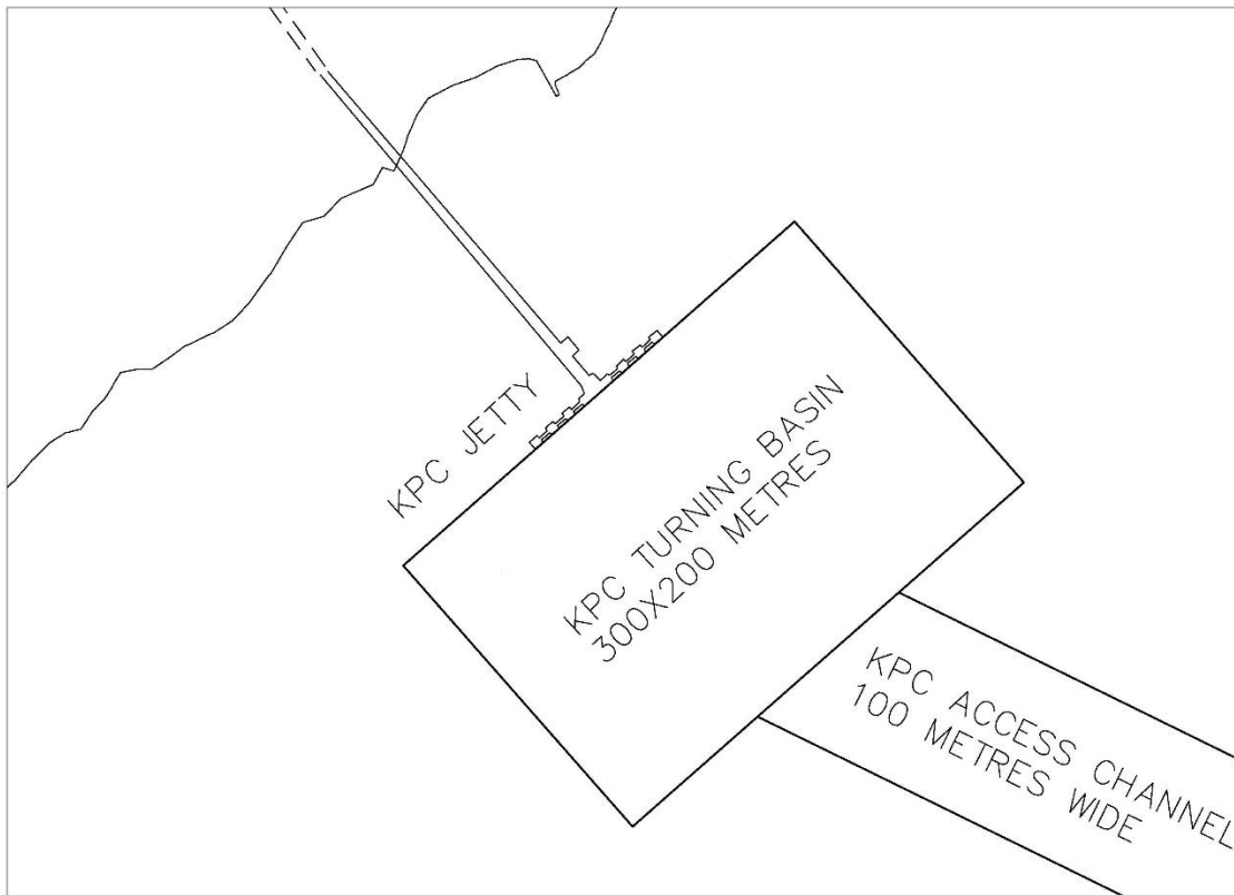
Figure 3: KPC Turning Basin Dredging Area