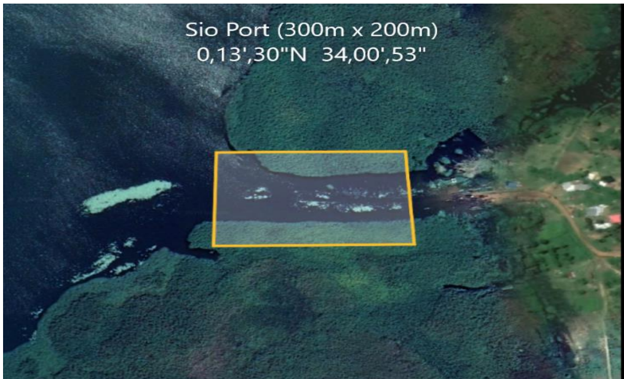
Figure 5: Sio Port