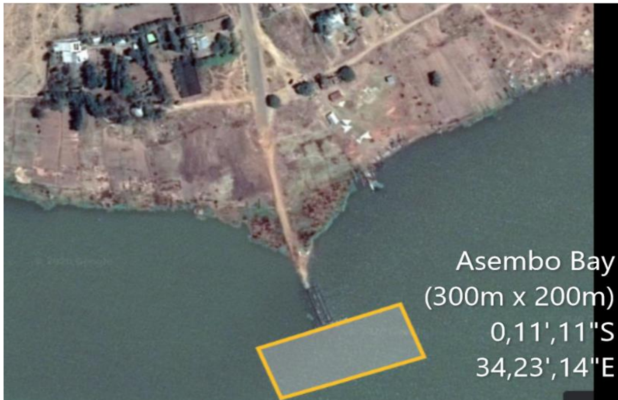
Figure 8: Asembo Bay Feeder Port